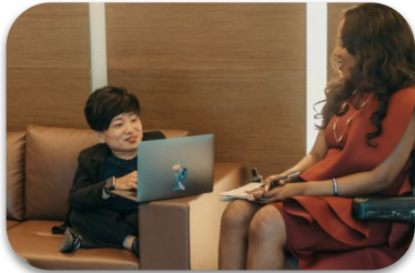
Disability inclusive imagery

Using inclusive imagery is important to make sure that the visual content you use in your communication represents the communities you serve. The following two resources are examples of image databases that bring together inclusive imagery for use in online content: