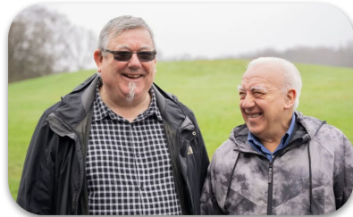
Age inclusive imagery